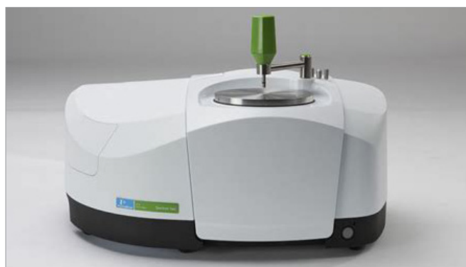
Figure 1. PerkinElmer Spectrum Two with Universal Attenuated Total Reflectance accessory.

36 spectra of pure Manuka honey (six replicates from six different commercially available products with differing UMF values) and one spectrum of each adulterant (beet syrup, corn syrup and rice syrup) were collected for the Adulterant Screen method. The spectra were pre-processed using a first derivative baseline correction, as seen in Figure 2.