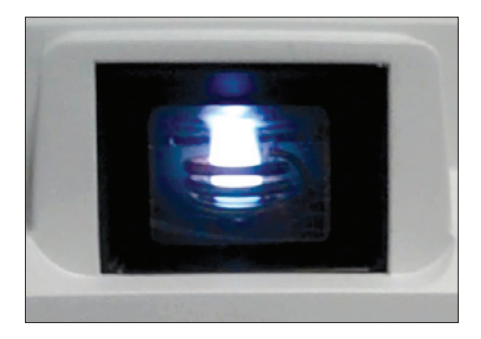
Figure 1. Plasma view on the NexION 300 ICP-MS.

To further reduce carbon-loading on the plasma, a 0.85 mm injector was used. Platinum cones were chosen to withstand the corrosive environment created by oxygen addition.