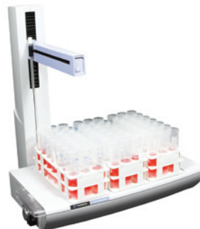
Figure 3. PerkinElmer S10 autosampler.

The PerkinElmer S10 autosampler (Figure 3) was used for high-throughput and automated analysis. The autosampler automates introduction of standards and samples for instrument calibration and sample analysis, extending the spectrometer's capabilities to those of an automated analytical workstation.