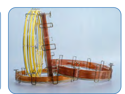
GC Capillary Columns