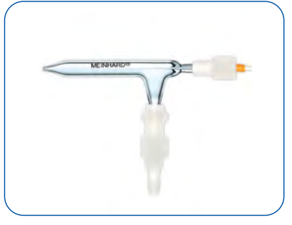
Concentric Meinhard Nebulizer

You invest great efforts into your research - and we do the same with our consumables and accessories, tested and validated to fit your lab's requirements. That's why we developed a full range of quality consumables and accessories suitable for a range of battery component analytical applications. Below is a selection of the most commonly required parts.