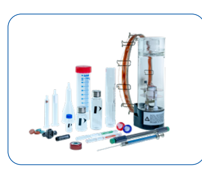
Concentric Meinhard Nebu GC Column, SPE. Graphite Tubes. LC Columns. AA Lamp, Torch, Syringe lizer