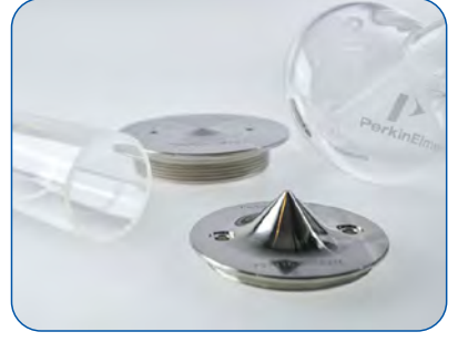
ICP Cones, Torch, Baffled Cyclonic Spray Chamber